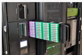
Loading 40 tapes at a time

Your data is critical to your business, but it can be expensive to store all your data. Tape is known for its affordability and Spectra Stack utilizes LTO tape media, a high-capacity tape storage technology designed for dependability and cost effectiveness. It's a powerful, scalable and adaptable tape format that addresses the exponential data growth and storage challenges organizations face today – at the most affordable cost per GB in the industry. For as low as 1 cent per gigabyte, Spectra Stack delivers an extremely reasonable data storage option.