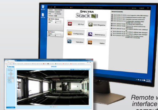
View of robotics from optional web cam