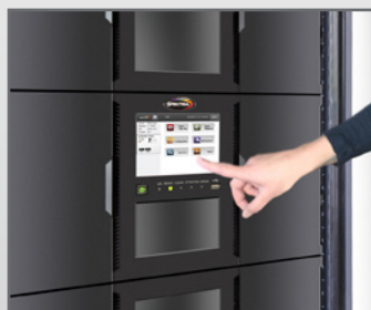
Convenient front panel color touchscreen

Easy to use and manage, the library's management software provides a similar feature set as the rest of the Spectra tape library family, including an intuitive color touchscreen, remote web interface, ability to create partitions (up to 20), built-in diagnostics, media lifecycle management, encryption, and encryption key management. An optional SpectraVision web camera can be mounted on top of the library to provide a visual assessment of all robotics and interior components.