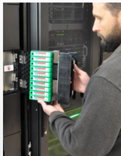
Loading ten tapes at a time